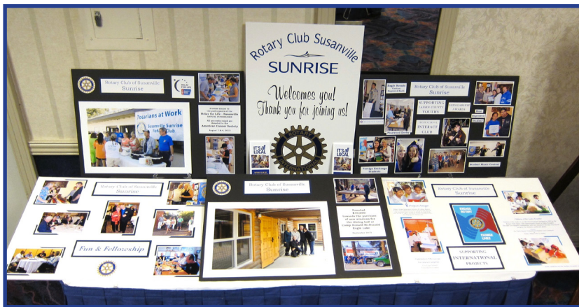
Susanville Sunrise At The District Conference